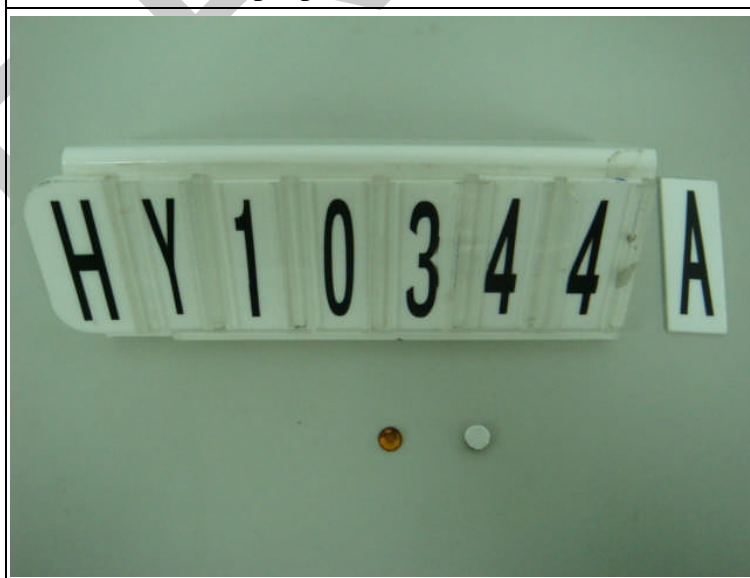
Sample picture (As received)