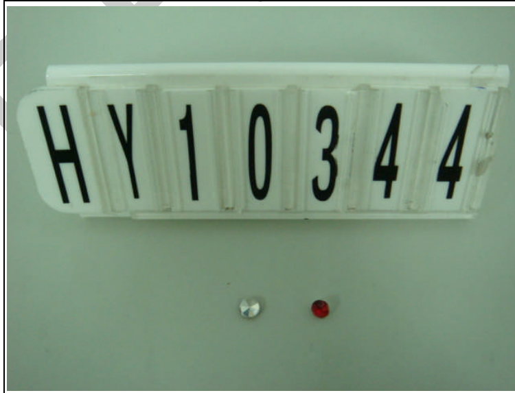
Sample picture (As received)